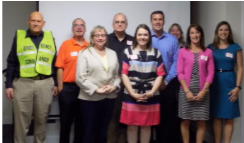
Pictured above – The ACP Liberty Valley Chapter Board and the Presenters