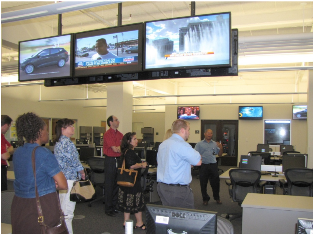
A glimpse inside the high-tech Joint EOC, which as members commented, have come a long way since IR team members stood around the table straining to listen to the one and only portable phone